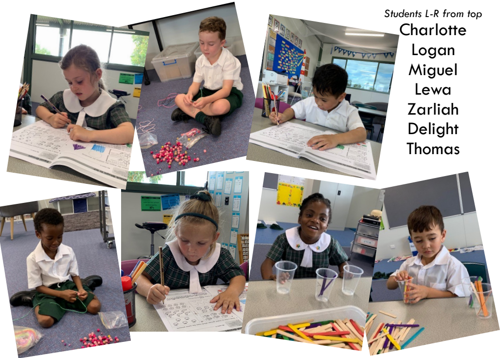
Students L-R from top